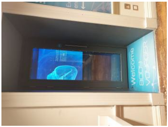
The entrance to Body Voyager from the dental collection on level 5. The door is 863mm wide