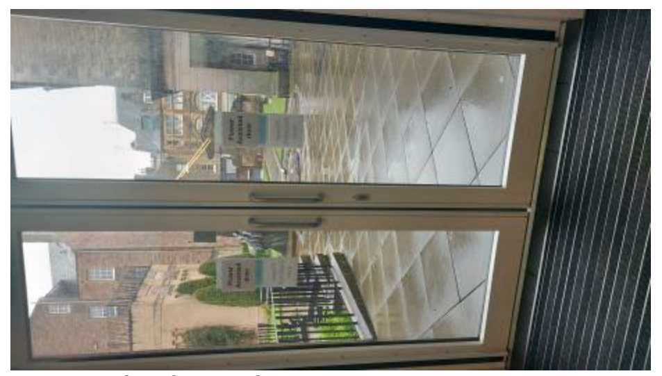
Automatic glass doors at the main entrance