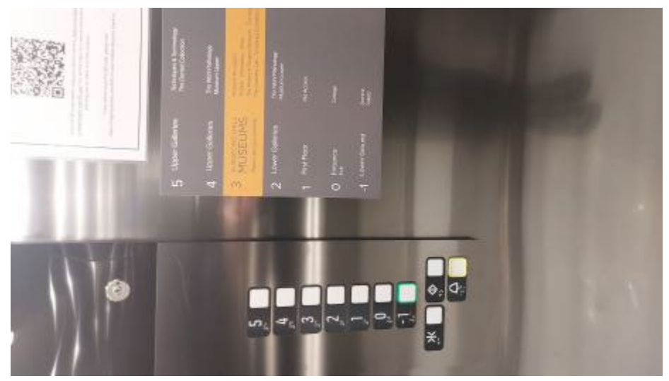
The lift buttons showing the raised areas near the buttons