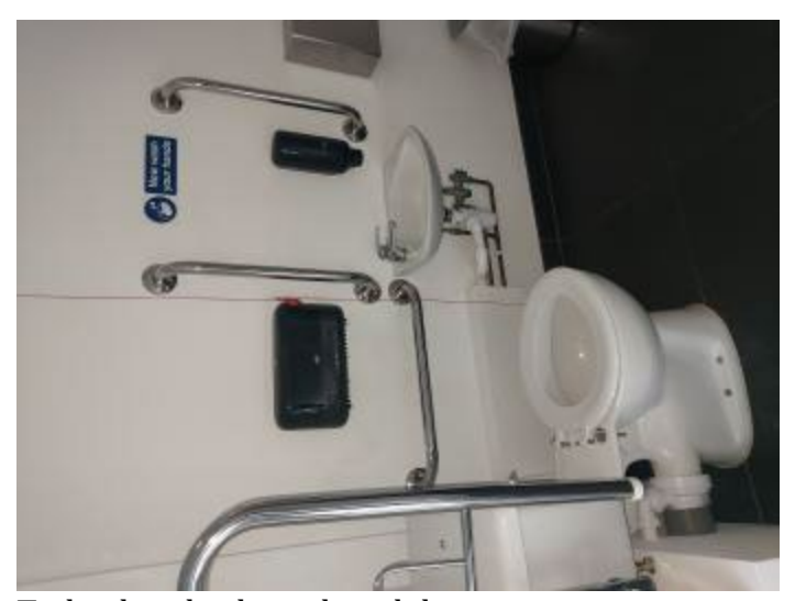
Toilet, handrails, sink and dryer.