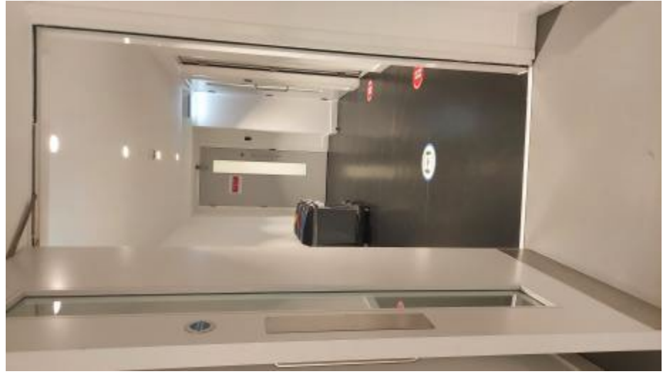
The corridor where the toilets are located. The doorway is 889 mm