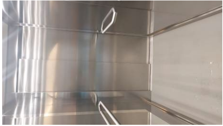
Inside the lift. There are doors on either side