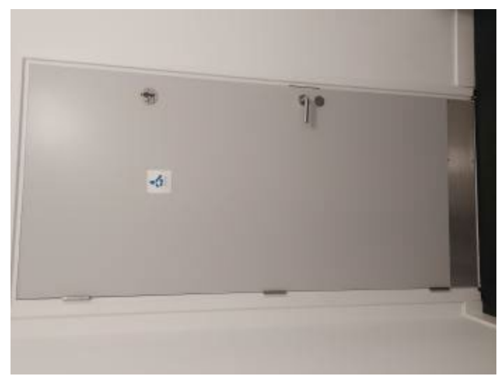
Door to toilet