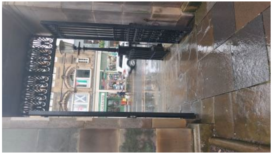
The gate to the main entrance