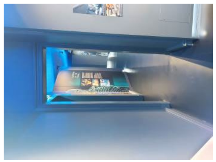
Doorway from section one of Body Voyager gallery to section 2.