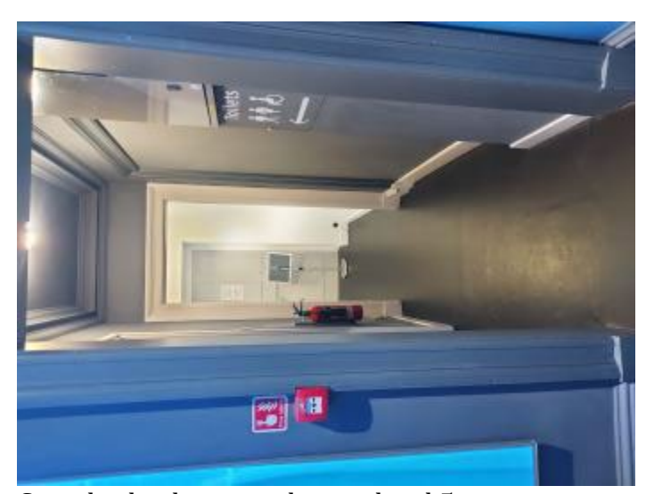
Corridor leading to toilets on level 5