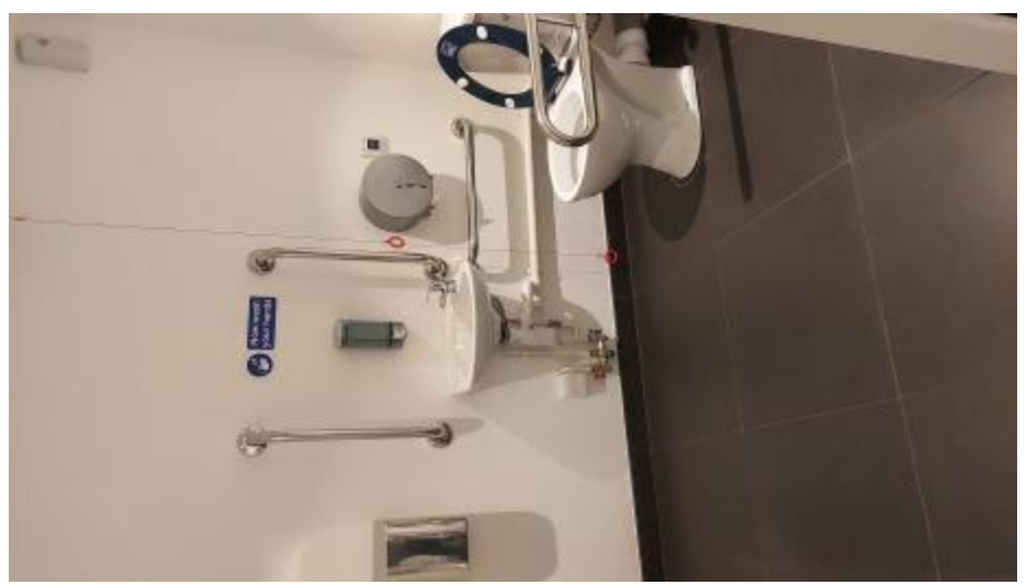
The accessible toilet. Showing the handrails, lowered sink and hand dryer and pull cord.