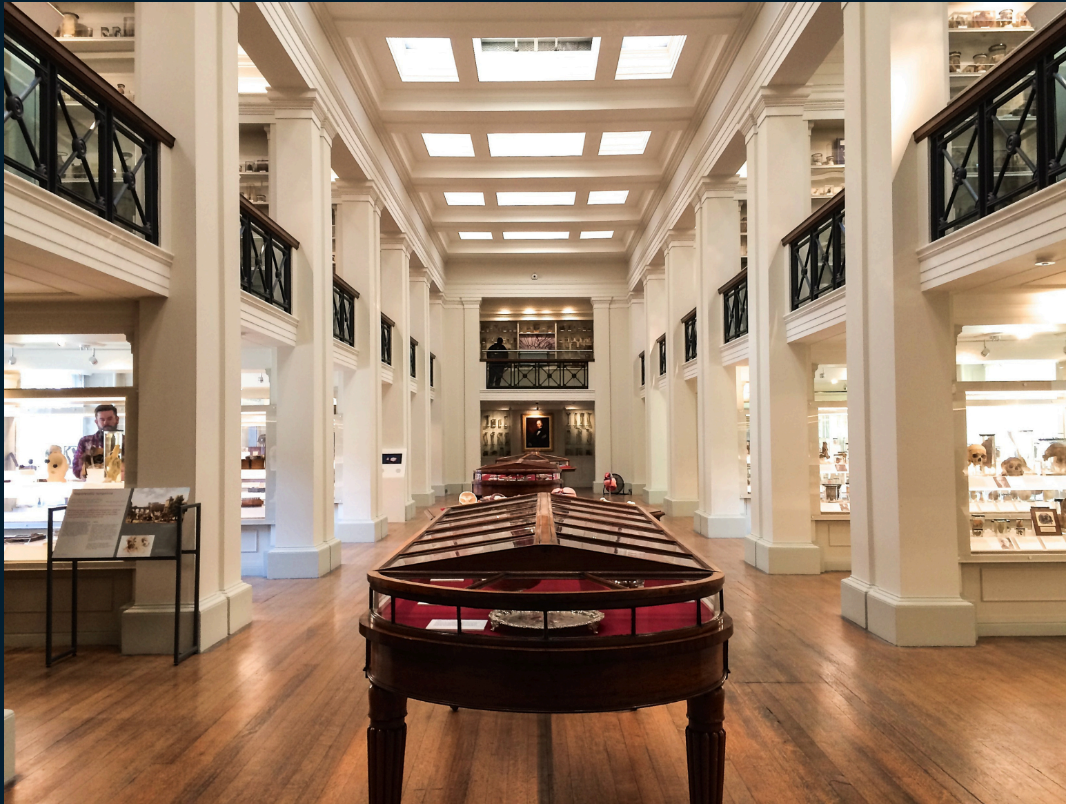
Level 2- Lower Wohl Pathology Gallery

The Wohl Pathology Gallery is split over 2 levels. Lower pathology can be found on level 2. On this level there are human remains on display. There are also some videos with audio that play on this level.