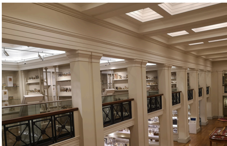
Photo showing a different perspective of the Wohl Pathology Museum