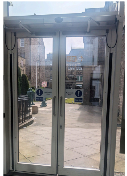
Automatic glass doors at the main entrance