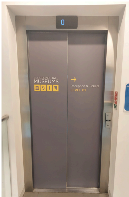
Photo showing the lift door