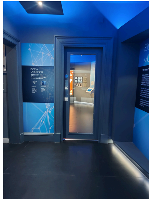
The second door to access the Body Voyager galleries. The door is 787.4mm wide