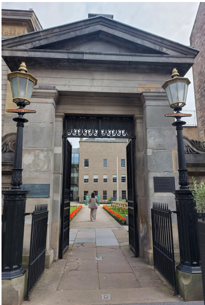
The gate to the main entrance