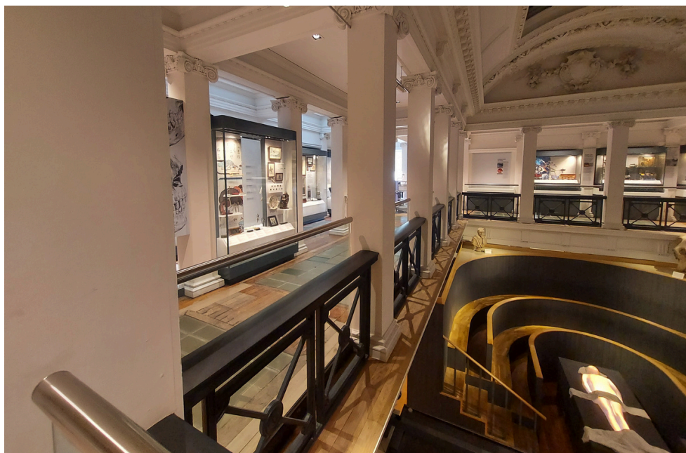
Photo showing a different perspective of the layout of the dental collection.