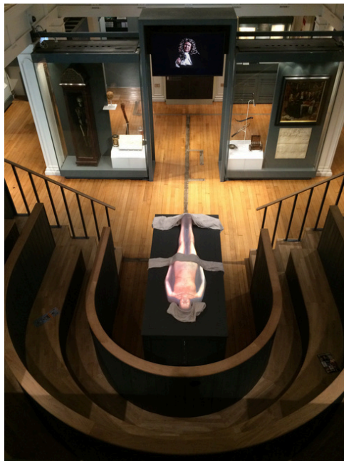
Image showing the layout of the anatomy theatre including the placement of the video screen