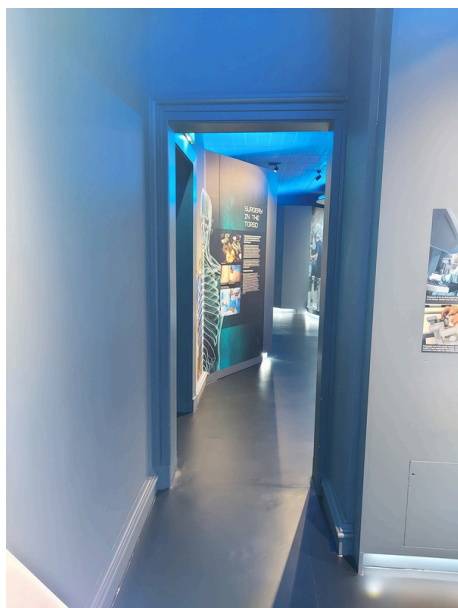
Doorway from section one of Body Voyager gallery to section 2.