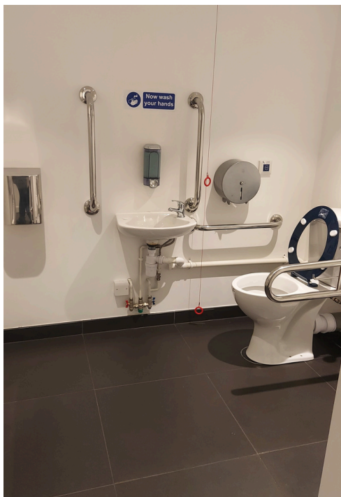
The accessible toilet. Showing the handrails, lowered sink and hand dryer and pull cord.