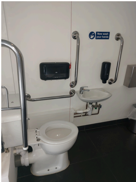
Toilet, handrails, sink and dryer.