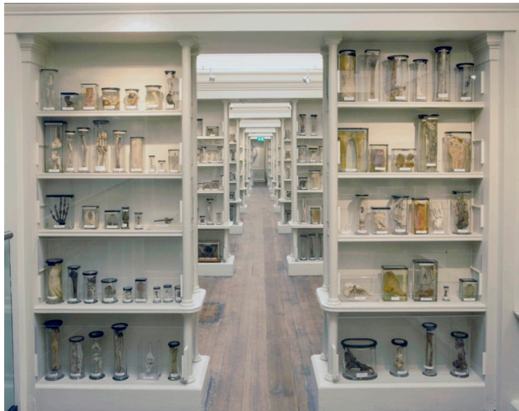
Photo showing the layout of the upper level of the Wohl Pathology Museum.