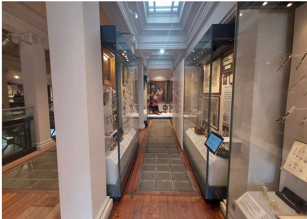
Photo showing the layout of the dental collection.