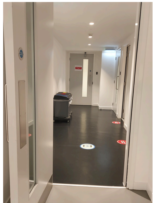
The corridor where the toilets are located. The doorway is 889 mm