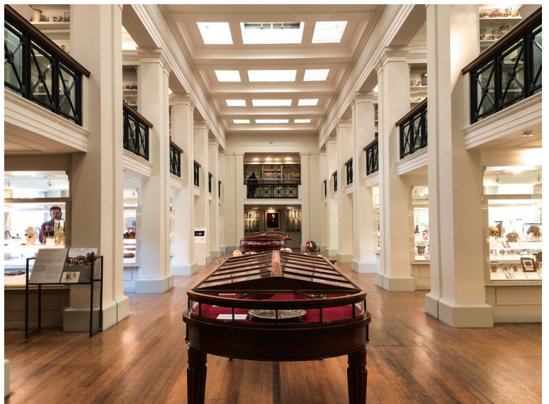
Photos showing the layout of the lower level of the Wohl Pathology Museum