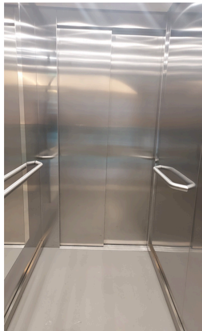
Inside the lift. There are doors on either side