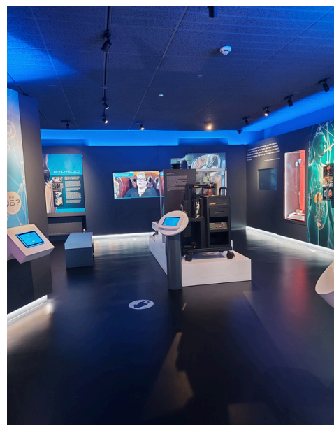
Layout of Body Voyager