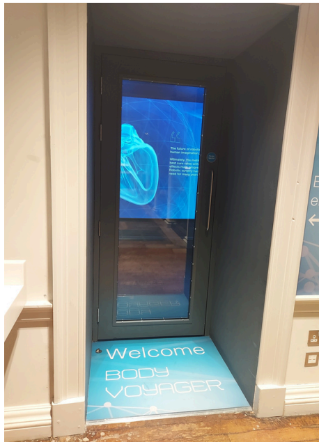
The entrance to Body Voyager from the dental collection on level 5. The door is 863mm wide