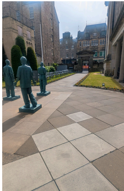
Photo of the garden, showing the narrowest part of the path